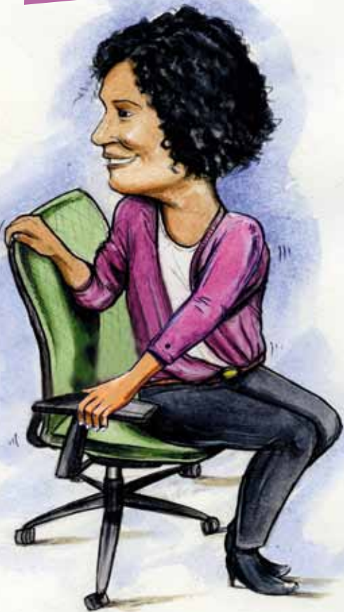
ILLUSTRATION: MARC GOODERHAM