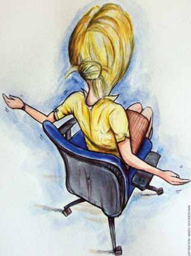
ILLUSTRATION: MARC GOODERHAM